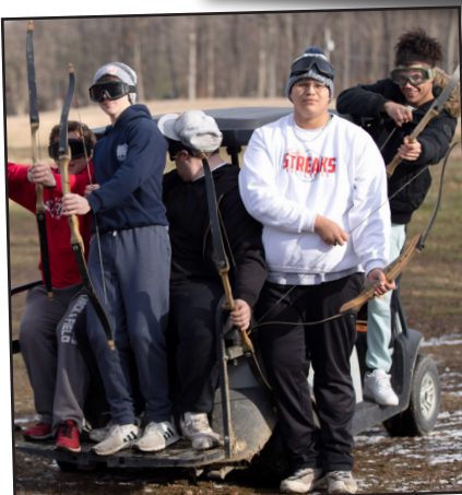
These young men are suited up for archery tag, which was one of many competitions held at Damascus.