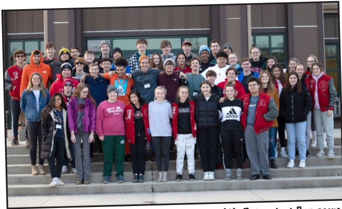
Juniors & Seniors are pictured at an Abundant Life Retreat at Damascus Catholic Mission Campus in December 2021. At this retreat the students experience encounters that invite them to further their relationship with Christ.

Students enjoy Catholic School's Week and class retreats