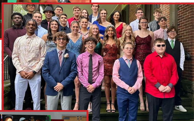
Continuing the long standing tradition of taking Homecoming photographs on the porch of the Rutherford B. Hayes home at Spiegel Grove, our Senior class poses for the posse of proud parents.