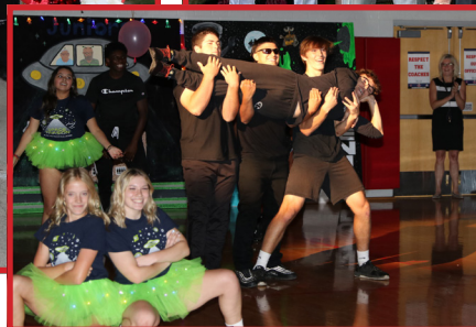
Channeling their inner Will Smith and Tommy Lee Jones, the football players transformed into the "Men in Black" while the cheerleaders were neon green Martians. The girls and boys had fun collaborating on this fun and creative dance.